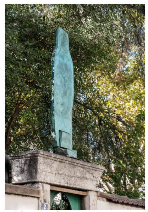
Katinka Bock, April Personne, 2013

The resemblance between the two sculptures intends to create a "déjà-vu" effect; the work located at the entrance, near the street – placed vertically – finds itself in a rather sheltered spot, surrounded by vegetation, while the one located inside the IAC is staged in the exhibition space, in a horizontal position.