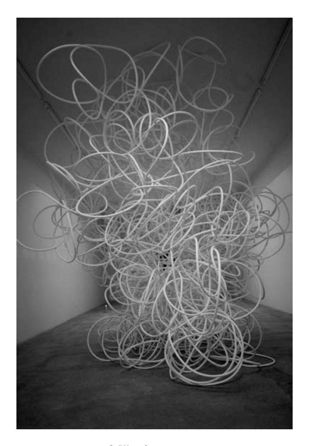
Scribble, 2008. Aluminium, plaster, PVC.